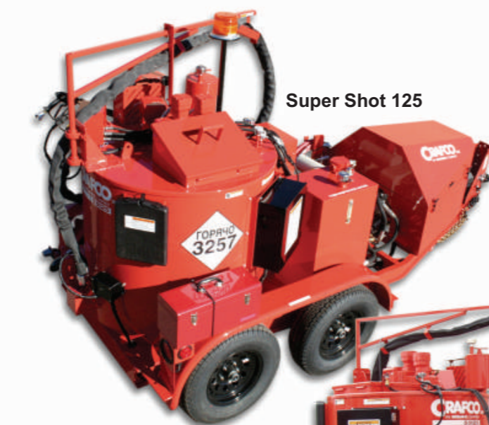
Super Shot 125