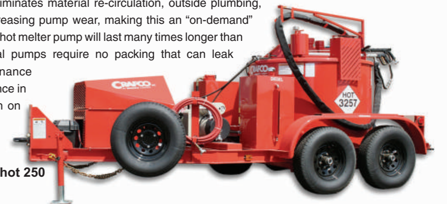
Super Shot 250

The patented pump technology of the Crafcro Super Shot melters is what makes the Super Shot the most productive and lowest maintenance melter in the industry. The Crafcro patented pump is mounted inside the melter. Mounting the pump inside eliminates material re-circulation, outside plumbing, high-pressure lines while decreasing pump wear, making this an "on-demand" system. The life of the Super Shot melter pump will last many times longer than conventional pumps. Internal pumps require no packing that can leak eliminating packing maintenance which results in less maintenance in the shop and more production on the job.