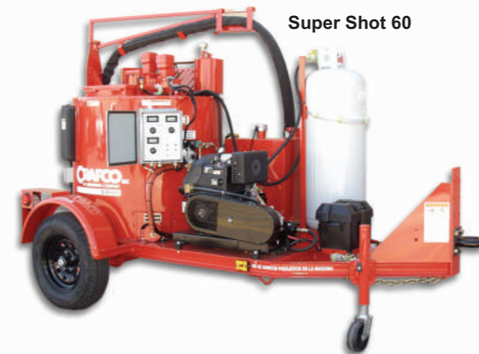
Super Shot 60

Items not indicated: Safety Chains, Breakaway Switch, Light Board, Fire Extinguisher, Auto Shut Off, Safety Manual, and Auto Loader.