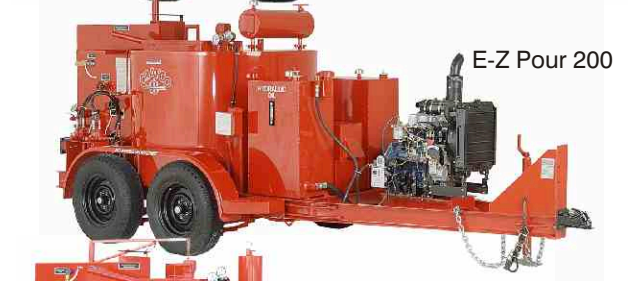
E-Z Pour 200