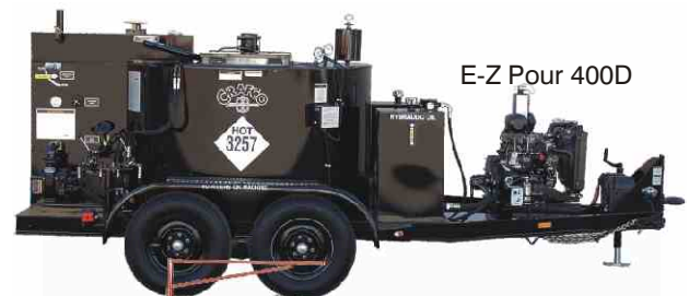
E-Z Pour 400D

For additional information contact Crafcio or one of Crafcio's Distributors. Crafcio has stocking distributors worldwide with regional factory support. Our national and international sales team will be happy to serve you.