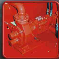
E-Z Pour 200

Better materials and quality craftsmanship make this a stronger and longer lasting pump.