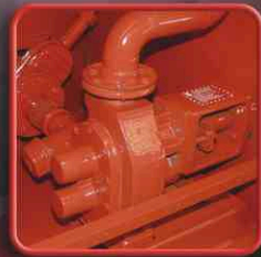
E-Z Pour 100