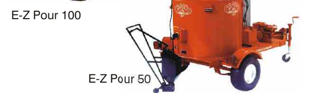
E-Z Pour 50