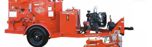
E-Z Pour 100